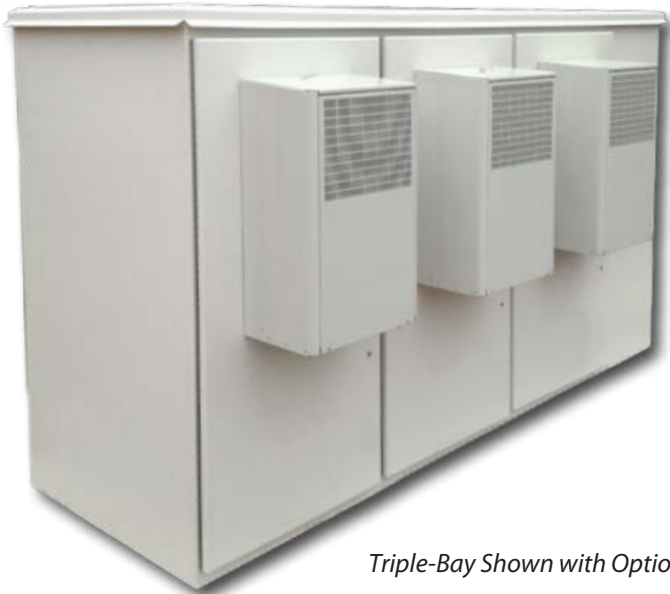
Triple-Bay Shown with Options