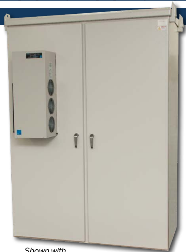
Shown with Climate Control

Lifting Eyes: Crane ready lifting eyes for a convenient way to offload and position your enclosure.