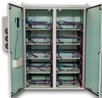
Dual Bay - Shown with Options