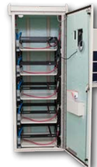
Single Bay - Shown with Options

Call a Sales Representative for Assistance.