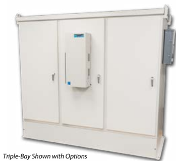
Triple-Bay Shown with Options